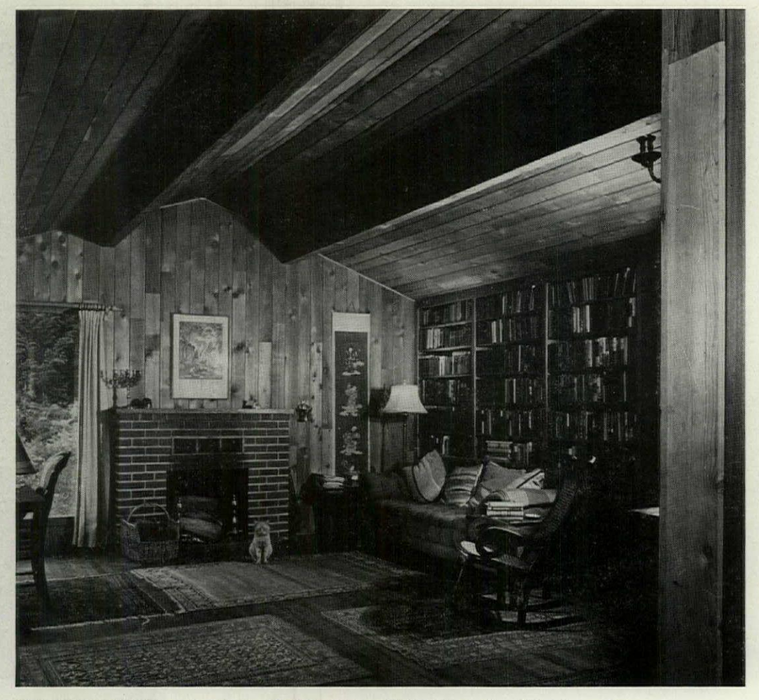
THE CEILING BEAMS running the length of the room avoid the clutter of an A-framing system.