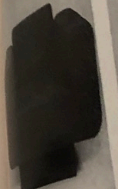
Editor: RS-1600 Series

EDWARD ASSOCIATION A person to the showrooms in fall, oohed r vator at the R There resplen ing purple v tional shape with arms and club cl Series take ly on the the arms unified b massive, plicated generous tation to