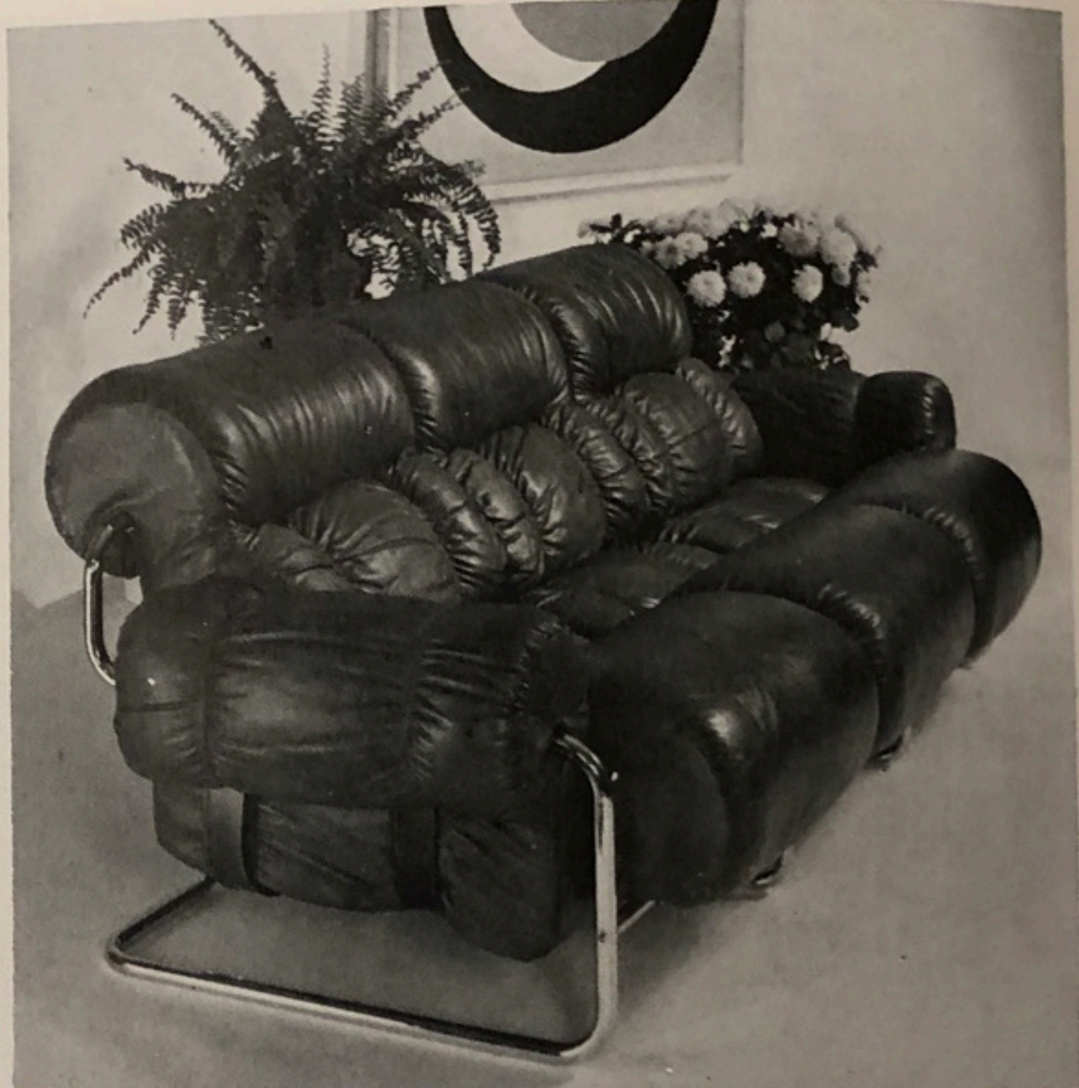
Pace: "Tucroma Series" sofa by Faleschini