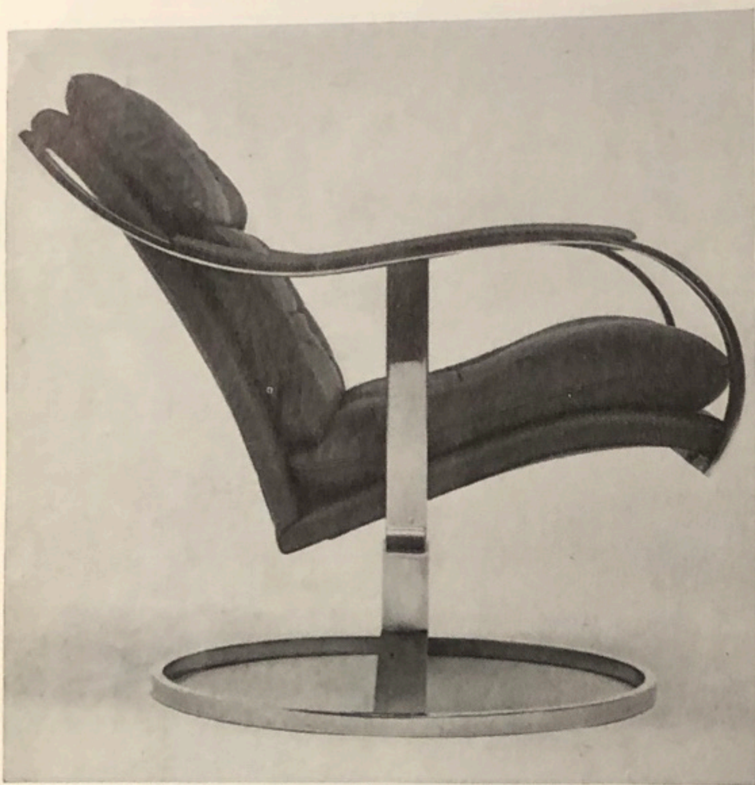
Steelcase: Gardner Leaver lounge chair