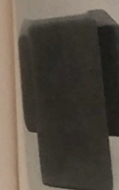
Editor: RS-1600 Series