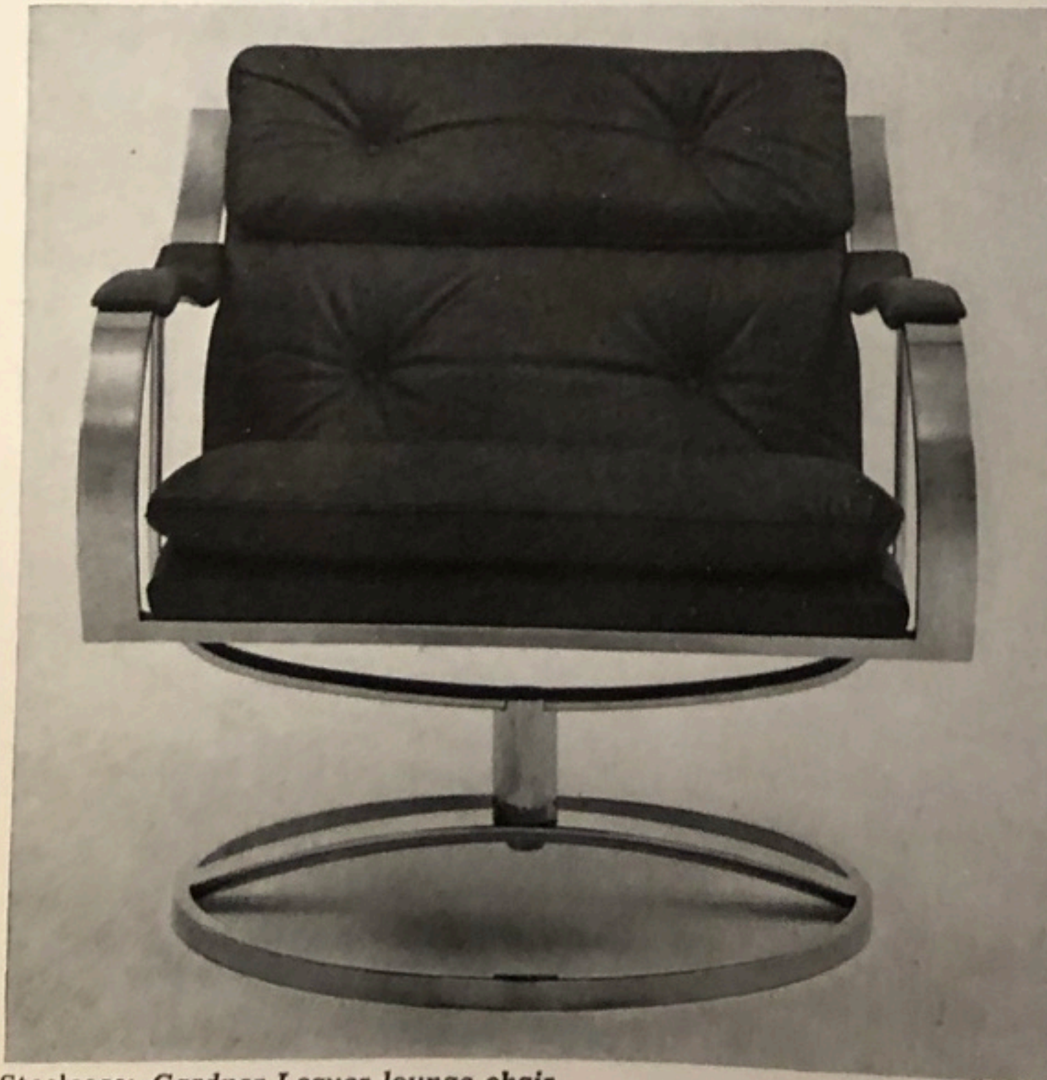
Steelcase: Gardner Leaver lounge chair