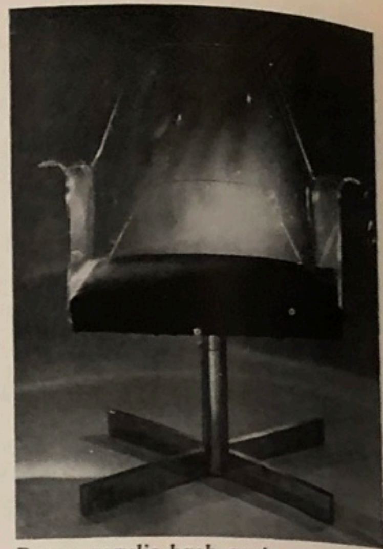
Pace: acrylic-back seat

Wow. Ask a guy to sit in the outer office to wait for you, stall long enough and when he walks in he'll be your slave. Impossible to imagine he'll be hostile after sitting in that sofa! His every ache has been caressed and comforted by the conforming cushions. He's had his hands on leather so soft to