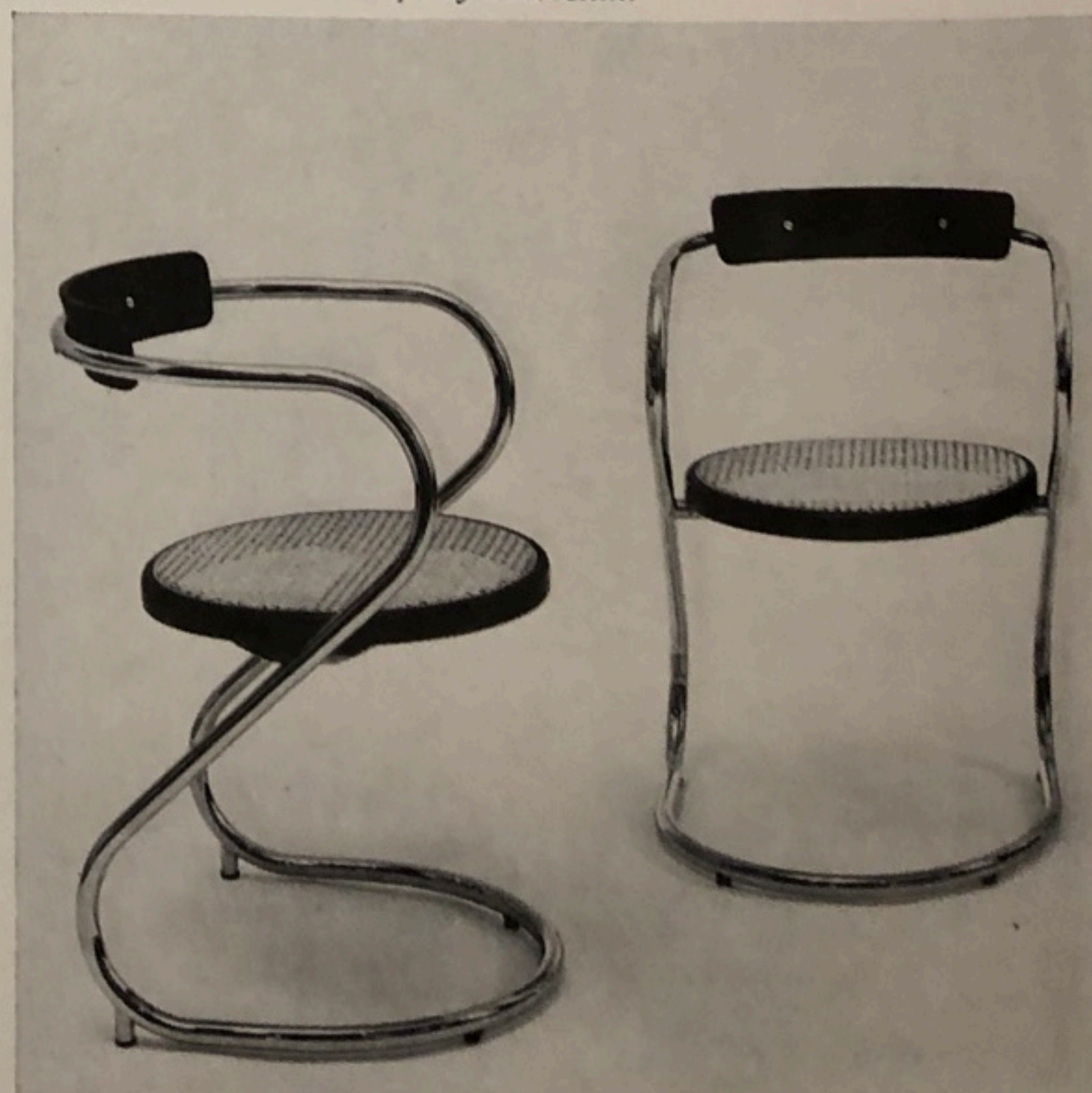
Pace: chair of curved chrome and comfort

EDWARD ASSOCIATION A person to the showrooms in fall, oohed r vator at the R There resplen ing purple v tional shape with arms and club cl Series take ly on the the arms unified b massive, plicated generous tation to