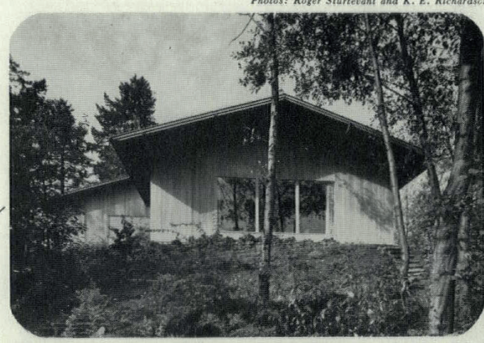
Neat picture window is set flush into eastern gable end