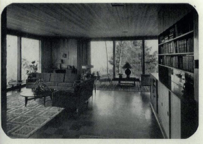
View of living room and windows overlooking valley and distant mountains.