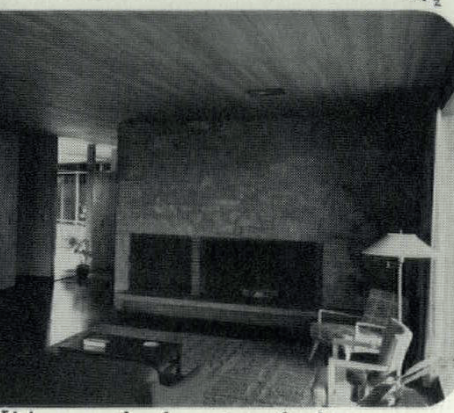
Living room has large stone fireplace. Garden court is seen at left.

View from carport into garden court. Entrance to living area is to left, at end of covered passage.